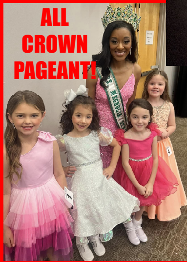
ALL CROWN PAGEANT!